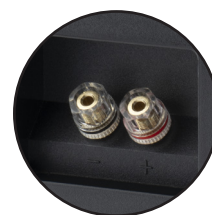
Gold plated terminals