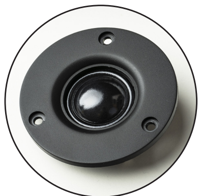
1" silk dome tweeter

For transparent and smooth treble response.