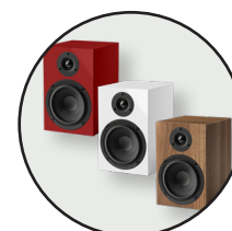
Available in high gloss black, white, red and wood