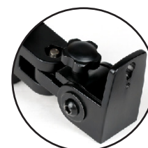
Wall mount separately available